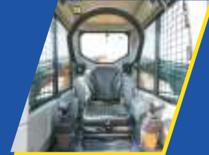
ภายในกว้างขวาง