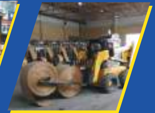
ใช้งานได้หลากหลาย